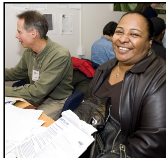
A volunteer and happy taxpayer

Super Saturday resulted in 134 returns filed at the Lloyd Center Tax-Aide site, where the festivities were held. Even more impressive were the dollar amounts returned to the pockets of taxpayers in just two days of action. Lloyd Center alone helped families and individuals claim $65,514 in Earned Income Tax Credits, adding to a total of $180,486 in federal returns, which will be heading into taxpayer's bank accounts in the coming weeks.